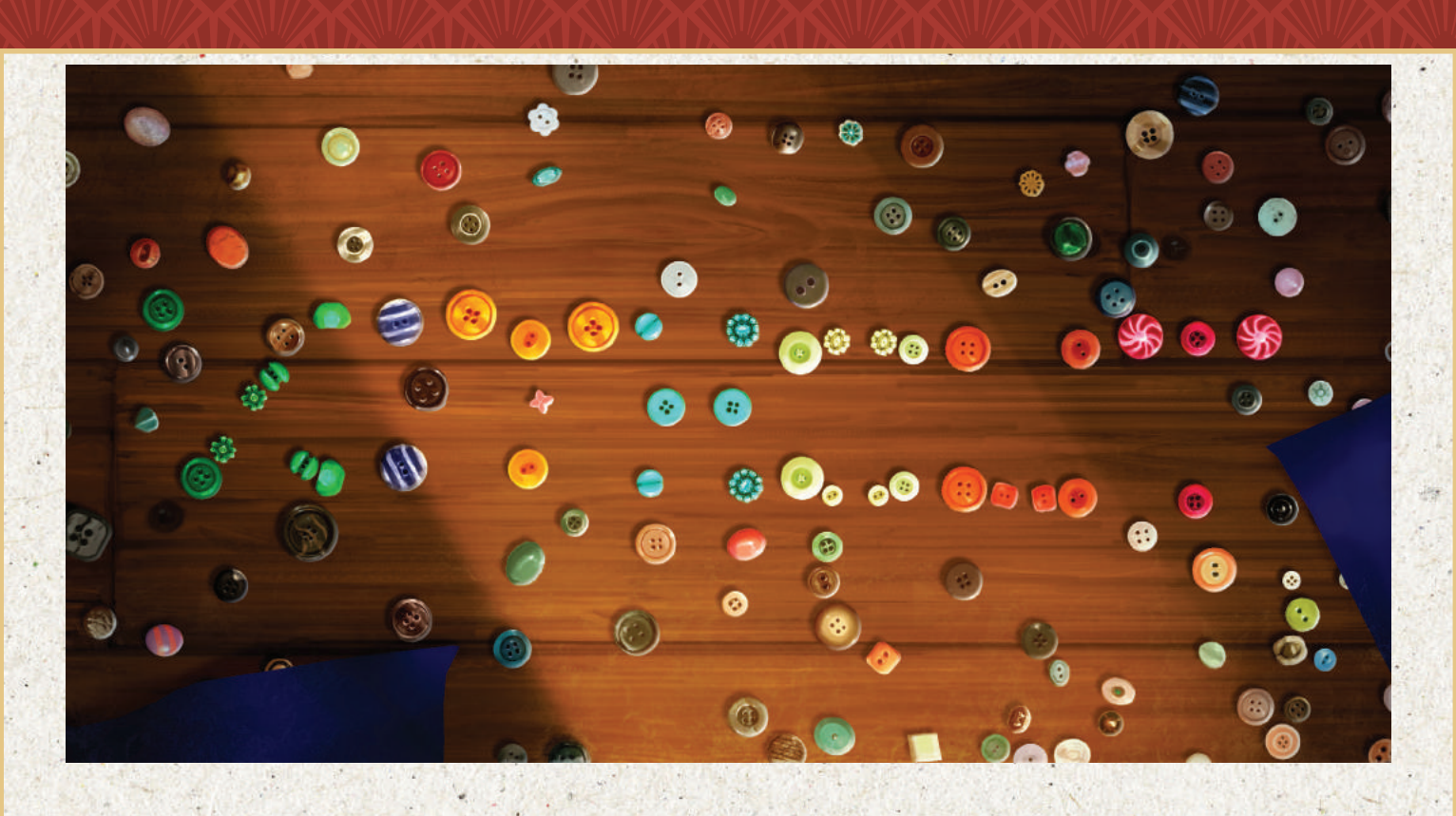
Line from same to same.